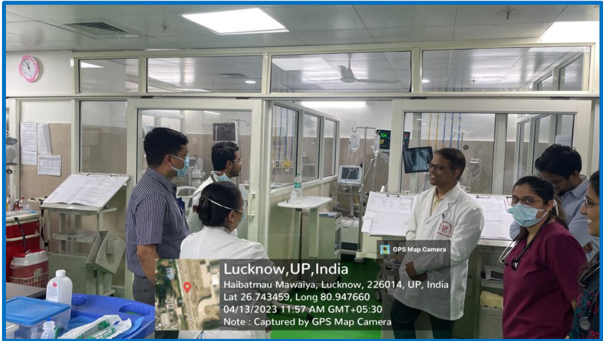
Teaching and learning through case discussion in ICU.