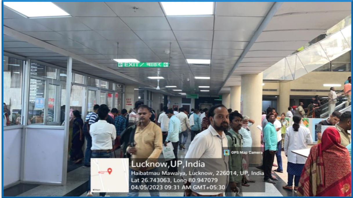
Large influx of patients in OPD areas