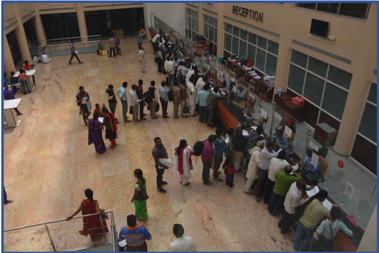
OPD Block for large influx of patients requiring consultation related to various specialties and a source of teaching and