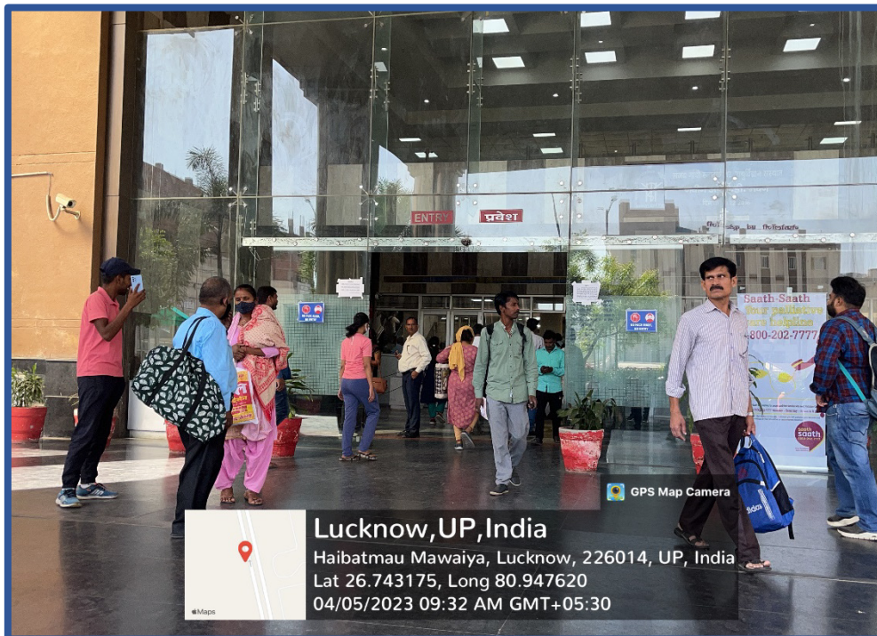
Continuous influx of OPD patients in hospital